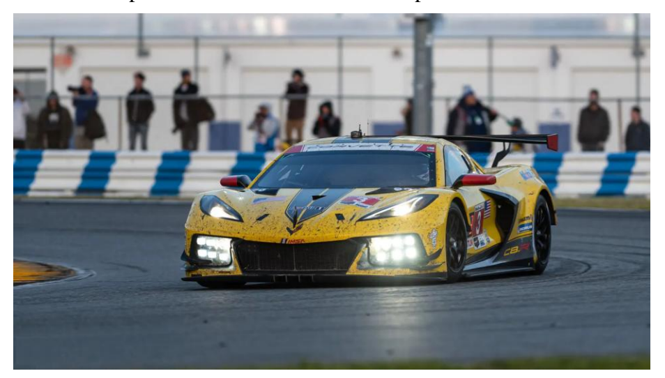
Read the full story here

DNF before they even start! General Motors confirmed to The Drive today that its brand-new Chevrolet Corvette C8.R race car will not be going to this year's rescheduled 24 Hours of Le Mans. Le Mans had been rescheduled from its traditional June date to Sept. 19-20 due to the COVID-19 pandemic.